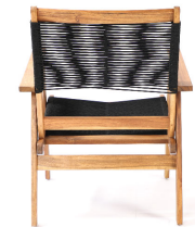
Kingsmen Sofa Chair W670 x D700 x H(s/b)400/840 mm 495 pcs / Cont. 40HQ 1 pc / Ctn.