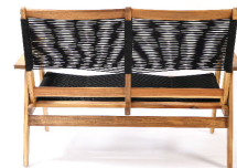
Kingsmen Sofa Bench W1200 x D700 x H(s/b)400/840 mm 402 pcs / Cont. 40HQ 1 pc / Ctn.