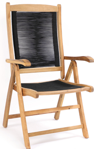
Paul Five Positions Chair W580 x D670 x H(s/b)445/1040 mm 596 pcs / Cont. 40HQ 2 pcs / Ctn.