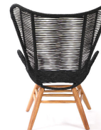
Queen Lounge Chair and Footrest Chair : W720 x D780 x H(s/b)425/1025 mm Footrest : W560 x D570 x H(s/b)380/470 mm 144 pcs / Cont. 40HQ 1 set / Ctn.