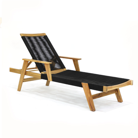
Kingsmen Sunlounger W730 x D2000 x H(s/b)350/550 mm 239 pcs / Cont. 40HQ 1 pc / Ctn.