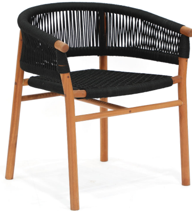
Nana Curved Back Chair W640 x D580 x H(S/B)445/735 mm 204 pcs / Cont. 40HQ 1 pc / Ctn.