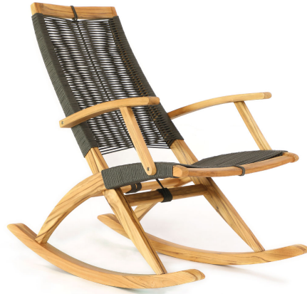
Lisa Rocking Chair W645 x D1020 x H(S/B)980 mm 386 pcs / Cont. 40HQ 1 pc / Ctn.