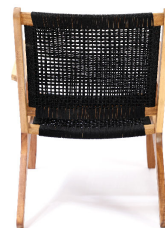
Kingswood Lounge Chair W620 x D750 x H(s/b)400/790 mm 473 pcs / Cont. 40HQ 1 pc / Ctn.